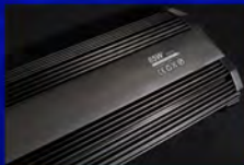
Aluminium heat sink