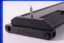
1.3 Inch Thin